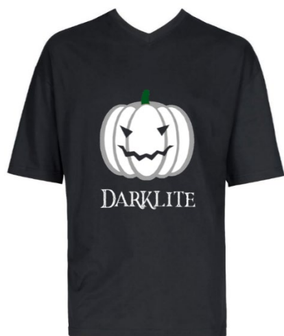
How it looks in a standard environment