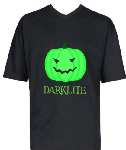
How it looks in dark environment